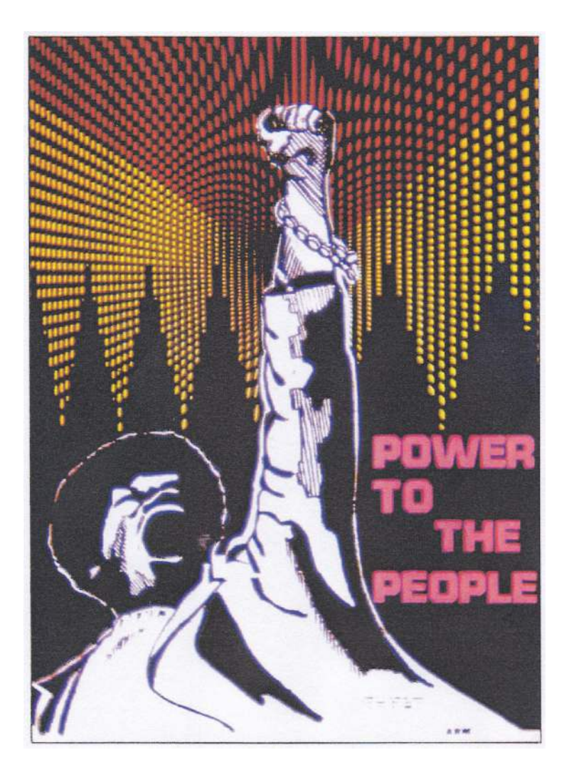
A poster by the Black Panthers, used in the late 1960s.